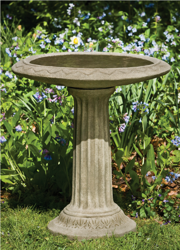
Shown in Verde