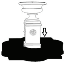
FT-29C/30D (579 lbs) 45"L x 045"W x 011"H

Assemble your fountain on a level surface capable of holding a minimum of 1,135 lbs with an approximate 14 sq. ft. footprint (actual dimensions 45" x 45").