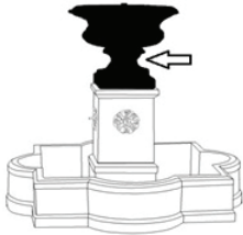
FT-30A (134 lbs) 18"L x 18"W x 21"H

Step 10 - Center the urn (FT-30A) over the column (FT-30B).