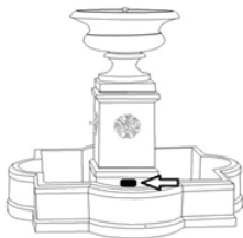
FT-29BB/30CC (4 lbs) 5"L x 1"W x 5"H

Step 13 - Place the 6½" copper pipe over the remaining pipe protruding off-center inside the urn.