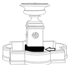
FT-29B/30C (52 lbs) 12"L x 12"W x 8"H

Step 5 - Place the pump cover (FT-29B/30C) over the pump. Ensure it is placed properly and leveled.