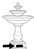
FT-388J (10 lbs) 7"L x 2.5"W x 4.5"H

Step 18 - Place the pump cover door (FT-388F) into the medium pedestal (FT-388E).