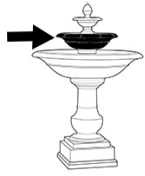
FT-388D (64 lbs) 25.25"W x 7.25"H

Step 10 - Insert both CPVC ends of Tubing Assembly #1 into the CPVC couplings in the bottom of the medium bowl (FT-388D).