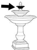
FT-388B (10 lbs) 12"W x 4.25"H

Note: The finial and small bowl fit together tightly. Gently rotate the finial left and right while pushing it into the bowl until the two pieces are secure.