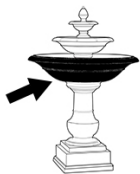
FT-388G (240 lbs) 46"W x 11.25"H

Step 7 - Insert the #7 Drain Stopper into the small drain hole.