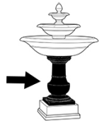
FT-388H (222 lbs) 15.75"W x 28"H

1a - NOTE: Check that all components are leveled as the fountain is assembled.