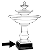
FT-388I (136 lbs) 20.5"W x 8"H

Assemble your fountain on a level surface capable of holding a minimum of 890 lbs with an approximate 3 sq. ft. footprint (actual dimensions 20.5" x 20.5").