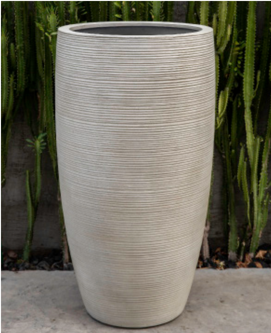
Shown in Ivory