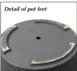
Detail of pot feet

Cleaning Instructions: Campania Lite® planters can be cleaned with either water or Windex® with Ammonia-D. Spray down the surface of the planter where it is dirty and use a lint-free cloth or sponge to wipe the surface. Note that it may take several cycles of wiping and drying before the planter is completely clean. This is normal and to be expected with the texture in the fiberglass. Do not pressure wash, use alcohol based cleaners, apply corrosive cleaners or clean with anything abrasive.