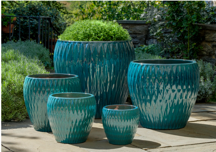
Shown in Blue Jade