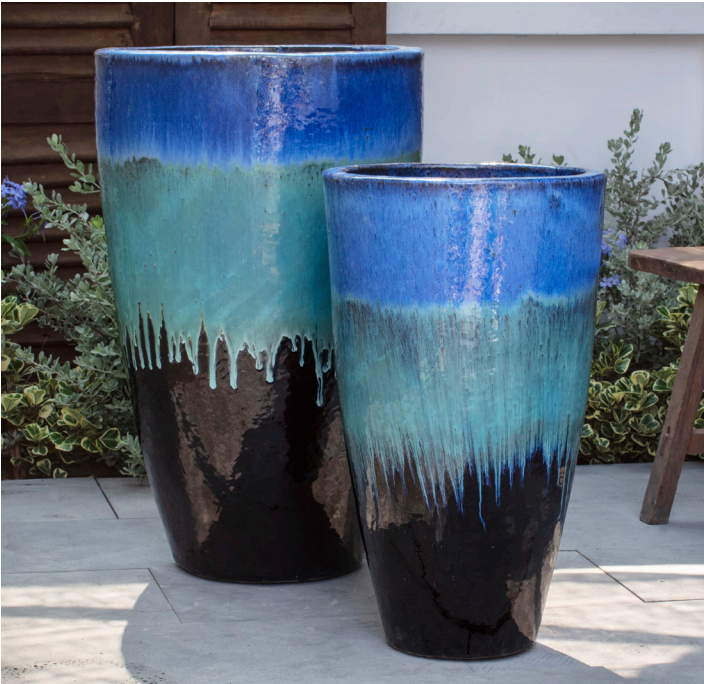
Shown in Running Blue/Brown