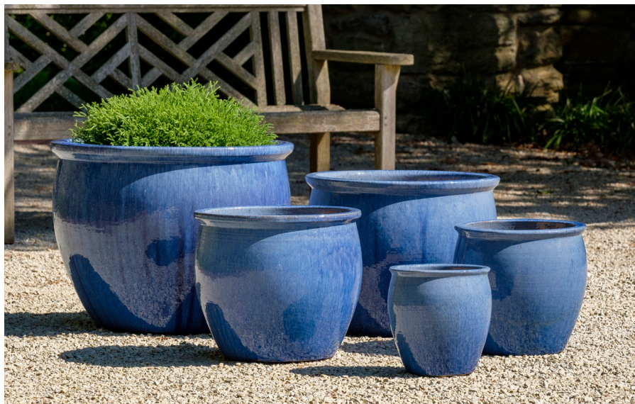
Shown in Marrakesh Blue