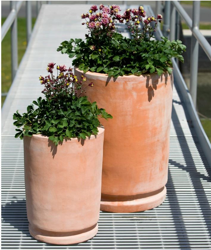
Shown in Terra Cotta