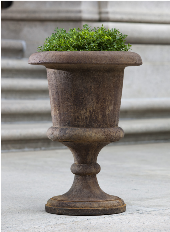
Shown in Pietra Nuova